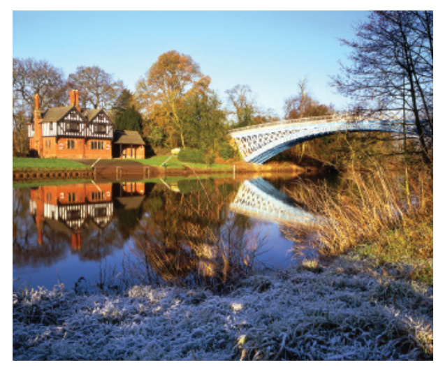
The Cast Iron Bridge and River Dee, near Aldford