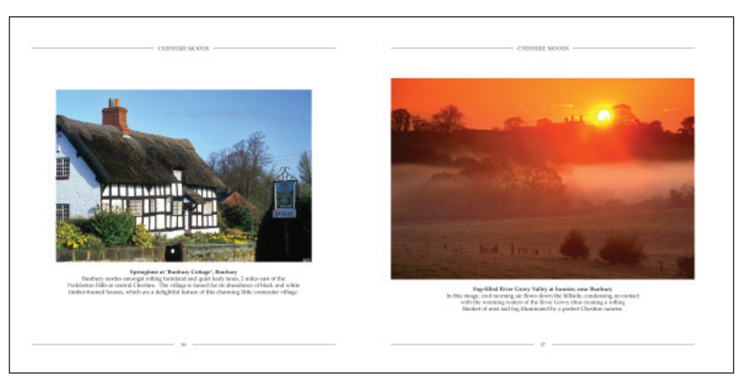
Example of a double page spread.