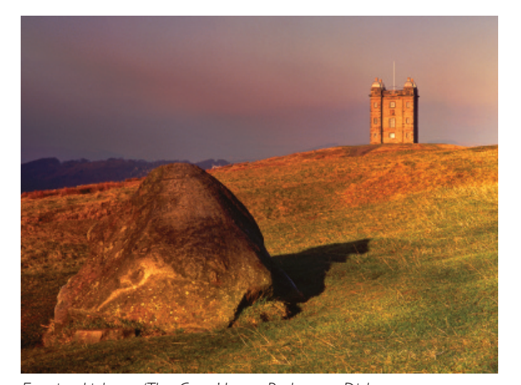
Evening Light on 'The Cage,' Lyme Park, near Disley